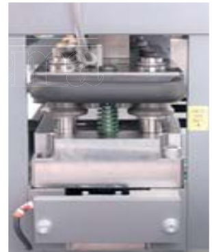
Oasys in house tooling