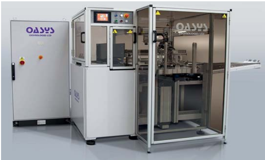
OCP 333A AUTOMATIC SHEET FEED WITH MULTI CHANNEL SHINGLING CARD EXIT CONVEYOR