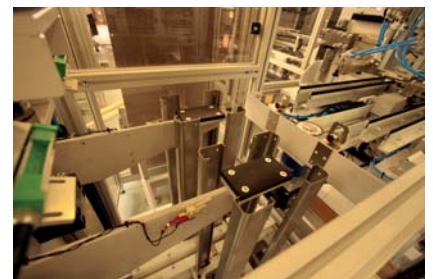
MAGAZINE STORAGE UNIT