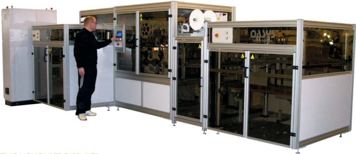
OMT165 MONOLAYER TAPELAYER (shown with fully automatic stacker)