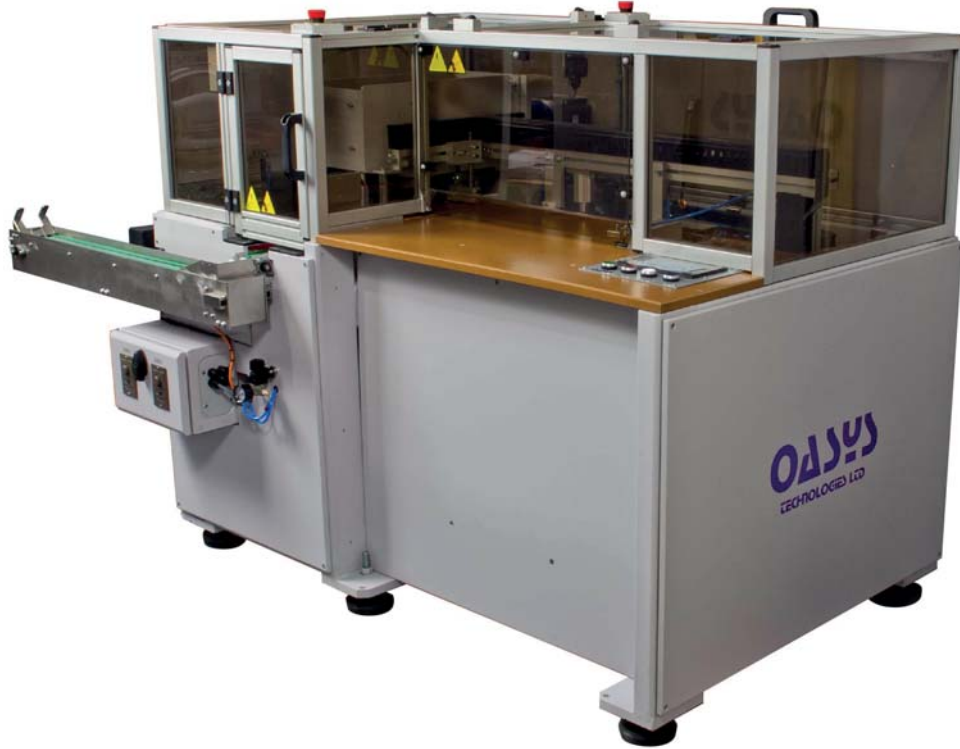
OCP 313M SEMI-AUTO SHEET FEED WITH SHINGLING CARD EXIT CONVEYOR