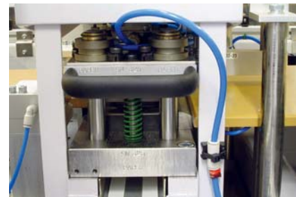
Oasys in house tooling