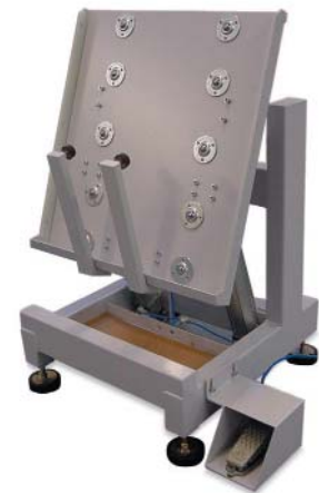
INTEGRAL TILT TABLES