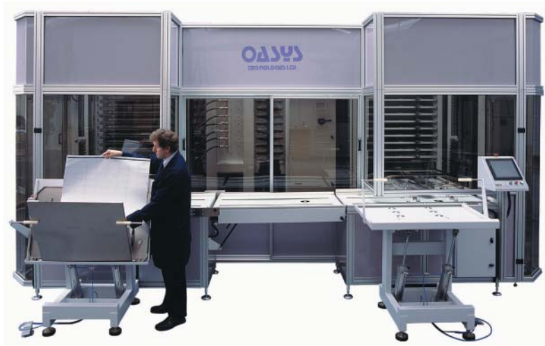
OTS SERIES TWINSTACK LAMINATOR