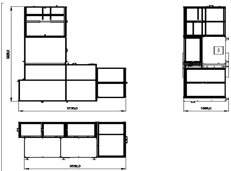
ODG600 DOUBLE GUILLOTINE FOOTPRINT