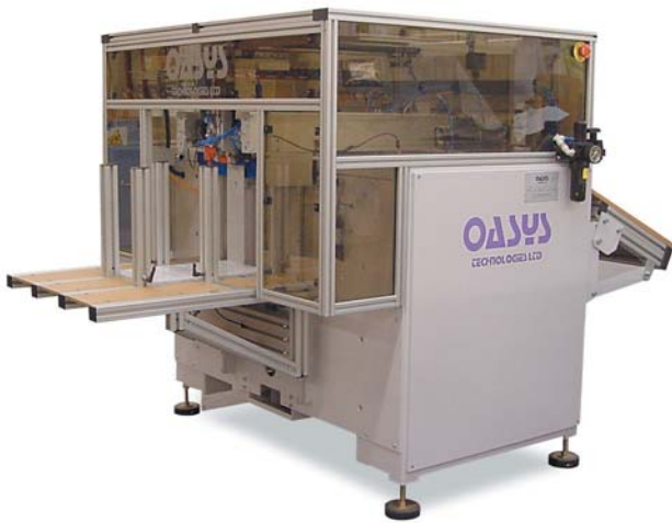
OSG800 SINGLE GUILLOTINE