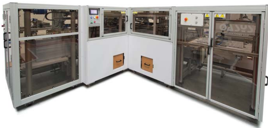
ODG600 DOUBLE GUILLOTINE