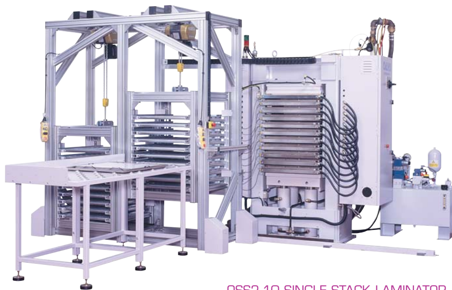
OSS2-10 SINGLE STACK LAMINATOR