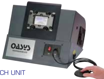
OEP100 PUNCH UNIT