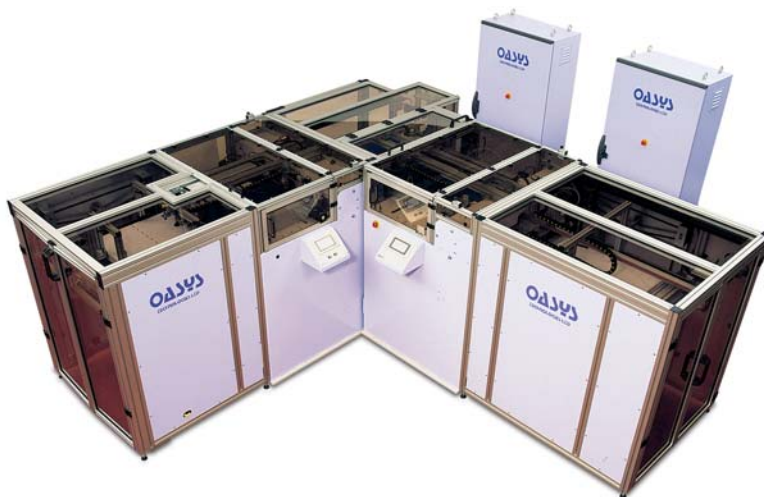
ODG600 DOUBLE GUILLOTINE