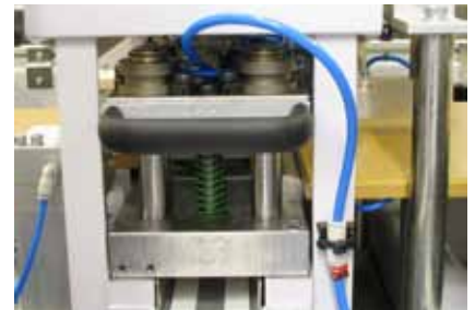
Oasys in house tooling