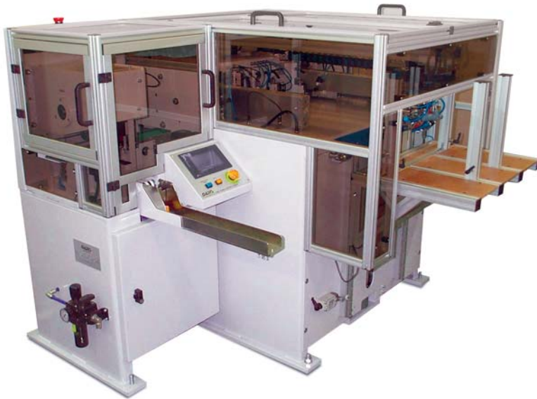
OCP201A SERIES PUNCH – AUTOMATIC FEED VERSION