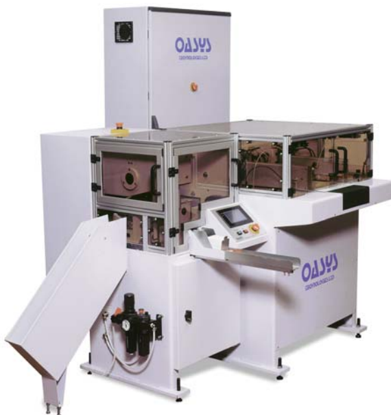
OCP201 SERIES PUNCH – MANUAL FEED VERSION