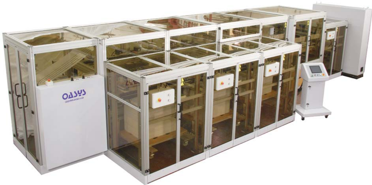
OCL600/3 FULLY AUTO COLLATOR